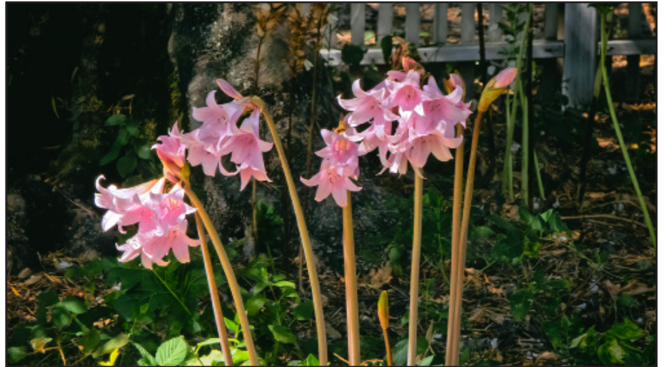
Naked Ladies (Amaryllis)

Here we are in the middle of August, 2025! The Cottage garden is hot, dry, lacking in rain and inspiration to grow very much. We have ground squirrels, gophers and the winds to struggle against - so no, not looking it's best!