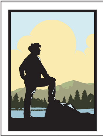
Jack London Park Partners